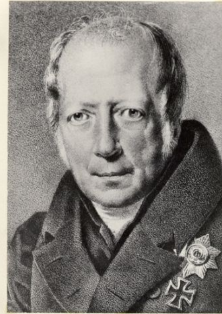
Wilhelm v. Humboldt